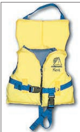
An example of the life jacket required for children under age 4 in Maryland.

A new life jacket law for children became effective in Maryland on April 1. The law specifies that if a child is less than 4 years of age or weighs under 50 pounds the child must wear a PFD with specific additional safety features including: a strap that is secured between the child's legs to fasten together the front and back of the PFD; an