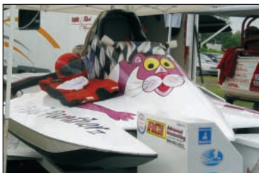
Spectators can get a close-up look at racing boats in the pits in Cambridge July 28-30.

This year's 95 th Classic will be held July 28-30 on the Choptank River at Great Marsh Park in Cambridge. Two titles will be up or grabs this year. The APBA has designated this Classic as the North American Championship and Cambridge will also be the first leg of the Maryland Cup. Points earned at Cambridge will be combined with those earned at Kent Island August