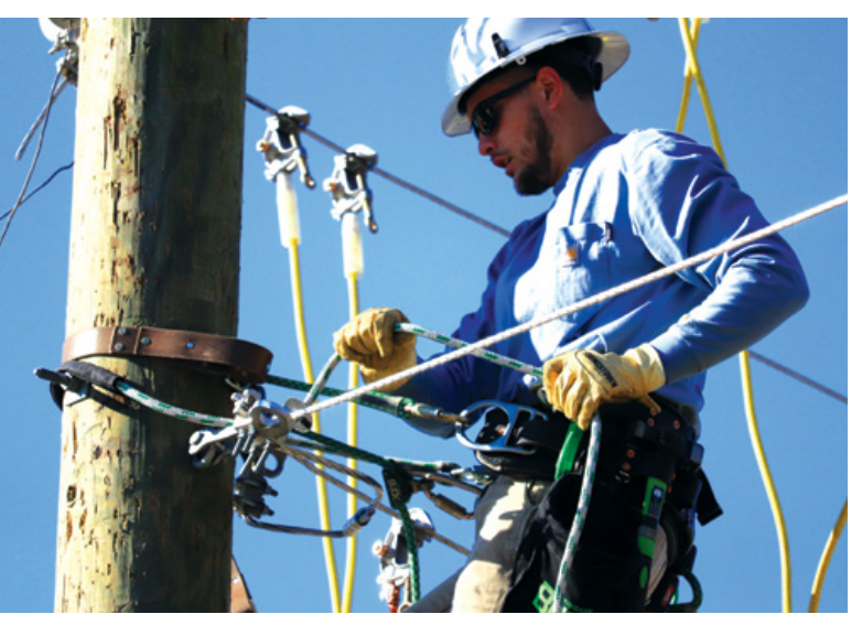
After the ceremony, graduates showed off the skills they learned.

Scan to watch our powerline worker program graduation video