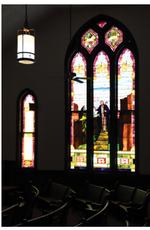
All stained glass has been restored

"Betterton Methodist Church has served the community for nearly 150 years. Choptank Electric Trust looks to support organizations who serve their community as well as respect the history of the area. With the support of the Choptank Electric Trust and much fundraising, Betterton